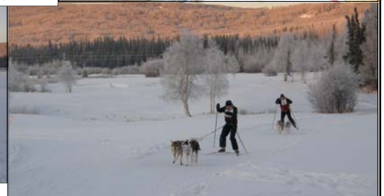
Coming in to the Finish line.