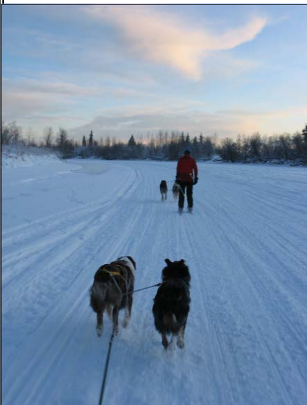
Away we go!! December 27th Trail Tour begins on the Chena River.